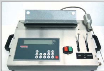
Fig. 4: Supplementary component Digital I with automatically cutting-out scales and F3M filling head for CO 2 bottles up to 6 kg and CO 2 fire extinguishers from 2-6 kg Art. No. 186156