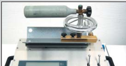
Fig. 5: F2M filling head for external CO 2 bottles with turning valve up to 300 g Art. No. 186102