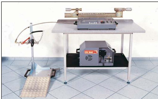
Fig. 2: The modular design of the CFA MOBIL facilitates application-oriented work places. For example, in this case the CFA MOBIL is mounted on the work bench, which is available as an accessory, with the supplementary component Digital II, including the F1 filling head. Larger CO 2 bottles can be processed with the additional floor scales platform for the supplementary components Digital I or Digital II.