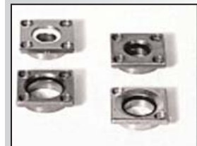
Fig. 9: (examples) Attachment flange Art. No. 186108

for filling CO 2 cartridges which are compatible with the F1 filling head (please state make and model of the fire extinguisher):