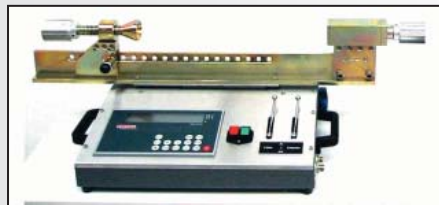
Fig. 6: Supplementary component Digital II with automatically cutting-out scales and F1 filling head for internal CO 2 cartridges Art. No. 186155