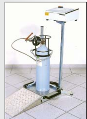
Fig. 3: Digital floor scales for CO 2 bottles 2 – 20 kg, with programmable display unit and automatic cut-out, including drop-down ramp (without bottle).

Collecting line for connecting 2 to a maximum of 6 CO 2 storage bottles (with ascending pipes) Art. No. 186106 (per connector)