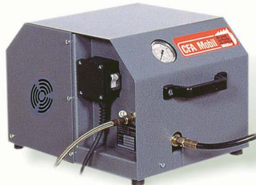
Fig. 1: The CFA MOBIL is a filling unit with all-round qualities. A particular advantage is the option of extending the equipment at a later date should the requirements increase.

Internal CO 2 cartridges, external CO 2 bottles and CO 2 fire extinguishers up to 6 kg can alternatively be filled with the supplementary components Digital I or Digital II, which are available as accessories. These units are connected to the CFA MOBIL electrically and with a CO 2 high-pressure hose.