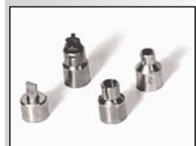
Fig. 10: (examples) Locking inserts Art. No. 186105