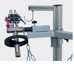
• The floor scales platform for CO<sub>2</sub> cylinders up to 50 kg is part of the system. Cylinder holder, filling armature

and high pressure hose are included. The weighing range is from 0 to 150 kg.