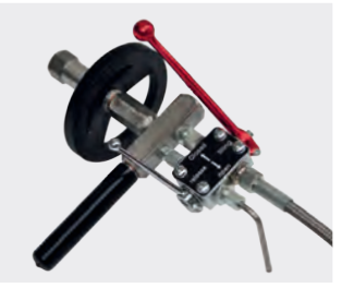
• The filling armature of the CFA 3 has one filling and one release ball valve and can be attached to the CO<sub>2</sub> cylinder as well as to the scales platform as necessary.