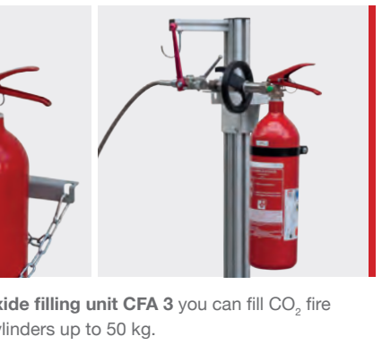
• With the carbon dioxide filling unit CFA 3 you can fill CO, fire extinguishers or CO<sub>2</sub> cylinders up to 50 kg.